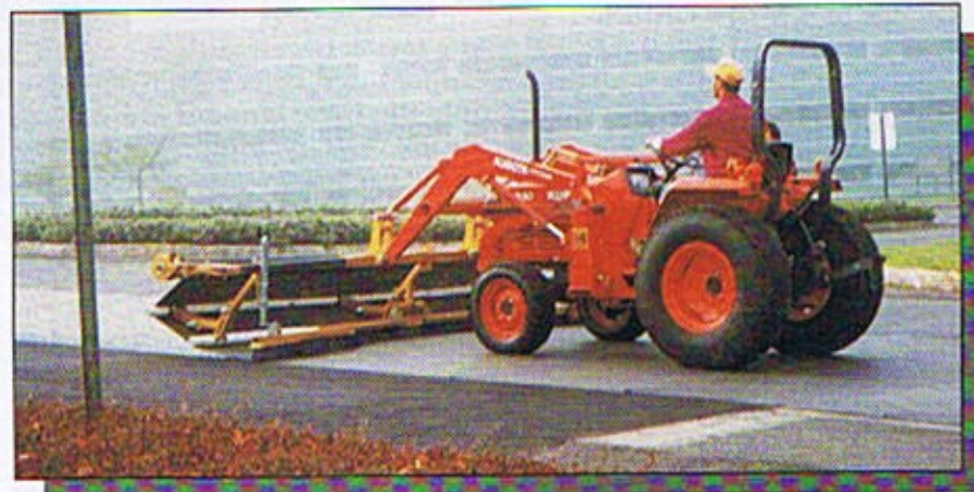
Installation equipment is available to mount as attachments on tractors (right), the back of the oil spreading trucks, tractor end loader arms, and on buckets (top right).