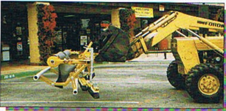
Proper placement of fabric roll on placement machine on a front-end loader.