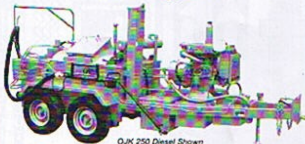
OJK 250 Diesel Shown

OIL JACKETED KETTLE Melter and Applicator