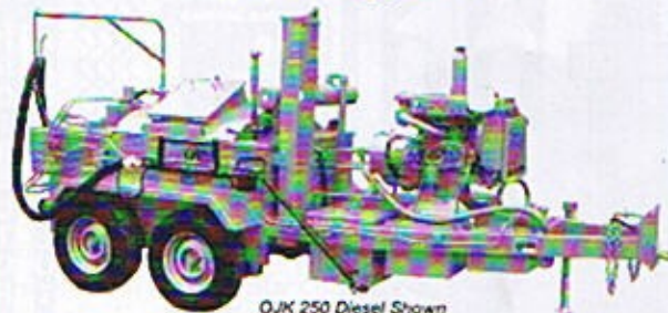
OJK 250 Diesel Shown

OIL JACKETED KETTLE Melter and Applicator