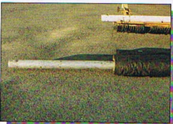
Reinforcing cores using aluminum or steel pipe can make damaged cores easier to use.

without hitting the pipe. This will reinforce the core from breaking and sagging. Having more than one pipe of the width being used will speed installation. Preload the rolls so the new roll can be loaded and the tractor or truck can be on it's way while the other pipe is retrieved. If one end of the pipe is cut and welded into a rounded point, the pipe can more easily be pushed or pounded through a roll that the core is already broken on. This makes the roll useable, avoiding wasted fabric. BYE