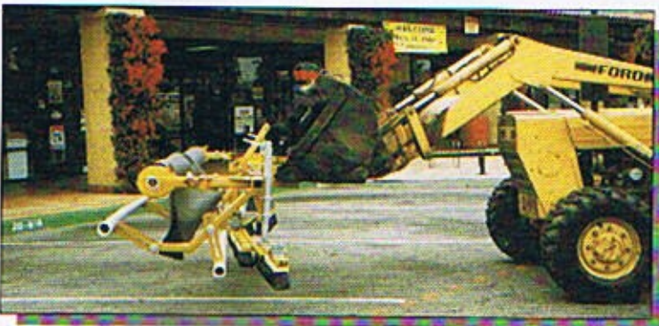
Proper placement of fabric roll on placement machine on a front-end loader.